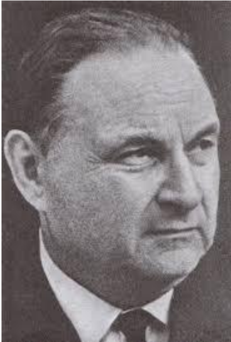
Konstantin Sergeevich Badigin/Константин Сергеевич Бадигин (b. 1910)