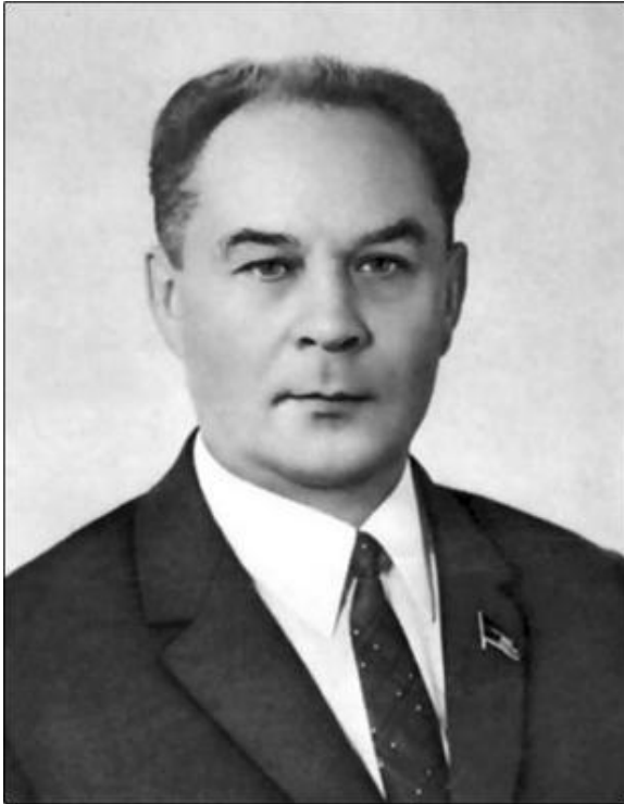
Alexander Nikolayevich Shelerin/Алекса́ндр Никола́евич Шеле́пин (b. 1918)

Opportunists (Marxism-Leninism/National Communism)