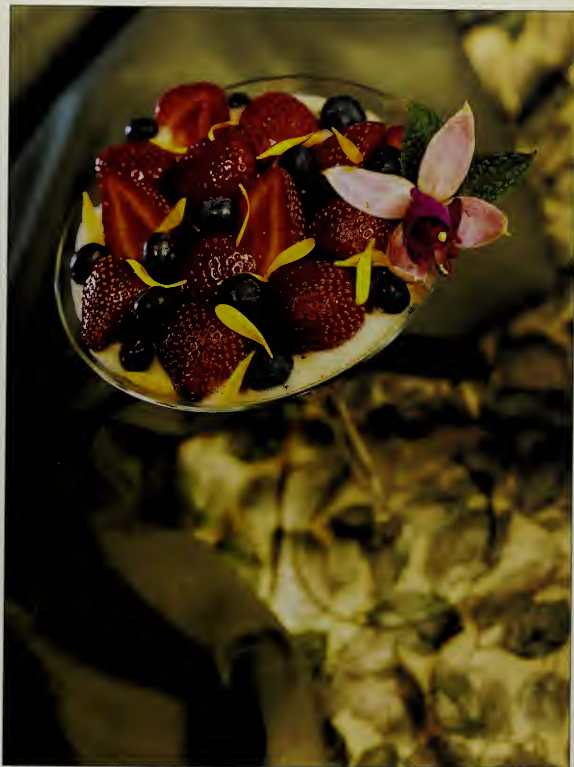
Fresh Fruit with Champagne Sabayon (page 72).