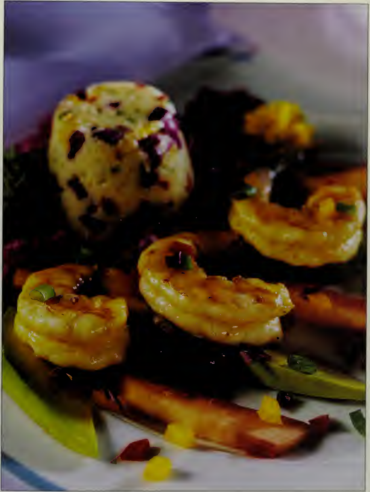
Lemon Pepper Shrimp with Herbed Couscous (page 51).