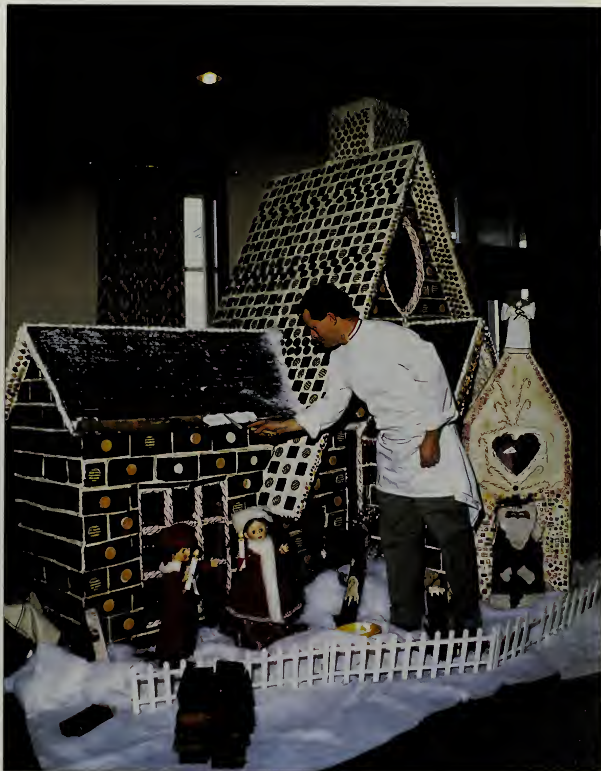
The building of the gingerbread house has become . . . each year's last loving ritual . . .