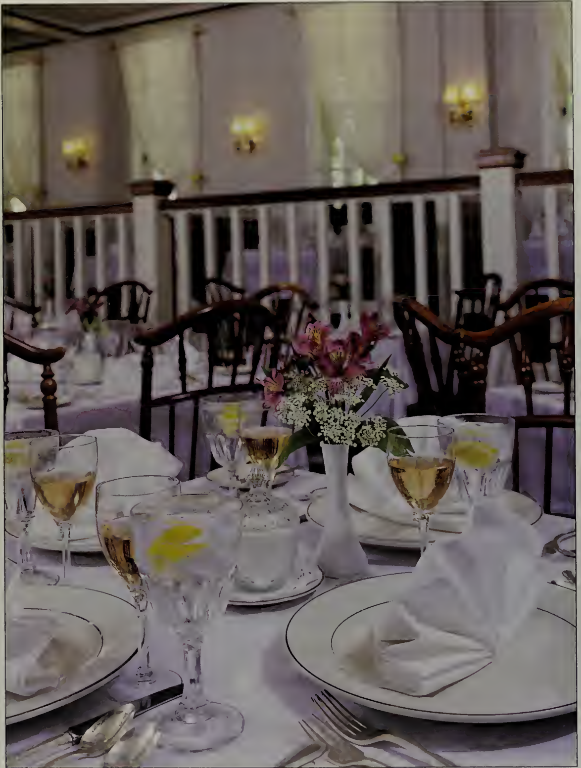
The dining room of Walden Inn of Greencastle.