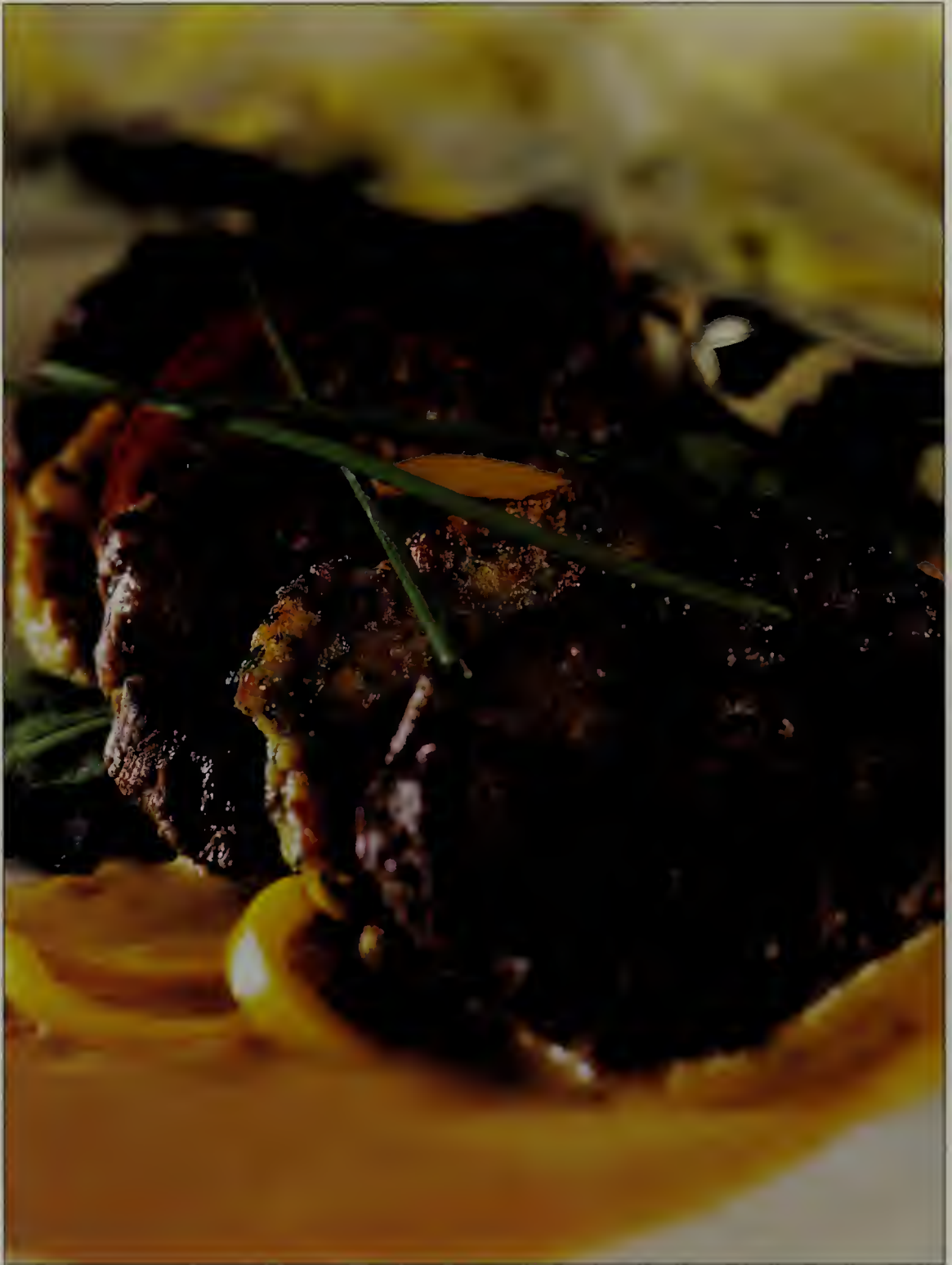
Medallions of Beef with Brandy and Peppercorn Sauce (page 17), accompanied by Potato and Red Pepper Pancakes (page 116).