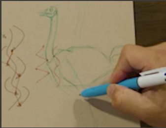
Fig. 1 Start with the gesture of the subject.