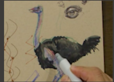
Fig. 3 Continue to develop the details and add values for completion. You also have the option to introduce white on the highlights.

Draw eight (8) single layout pages of big and small birds. A page layout should contain a 2D proportion, a 3D structure, a zoomed-in detail or callout, and a full drawing with a focal point. You can work from life or use the photo references provided by NMA in this lesson. Use an artist pen, colored ballpoint pen, and/or markers for this assignment.