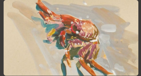
Fig. 3 For the colored sketches, make sure you still start with the gestures and big shapes before introducing colors.

Draw eight (8) single pages of insects and tropical animals using the photo references provided by NMA in this lesson. Include color sketches on at least two (2) out of eight (8) pages. You can choose to work with gouache, colored pencils, or colored markers. Focus on the design of the gesture, shape, and structure. For working in color, loosely lay in the initial drawing of the main structure. If using gouache, add a wash of water over the drawing. Then, slowly add color and fill in the shadow mass. Introduce the temperature shifts and add the light mass. Refine and add a background for completion.