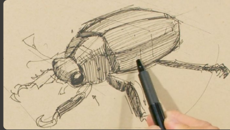
Fig. 2 Continue to build up the structure of the subject and add values.