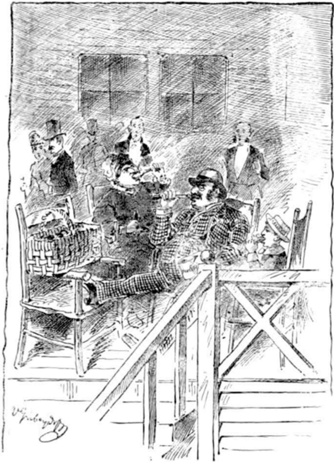
ON THE SUMMER-HOTEL VERANDA.