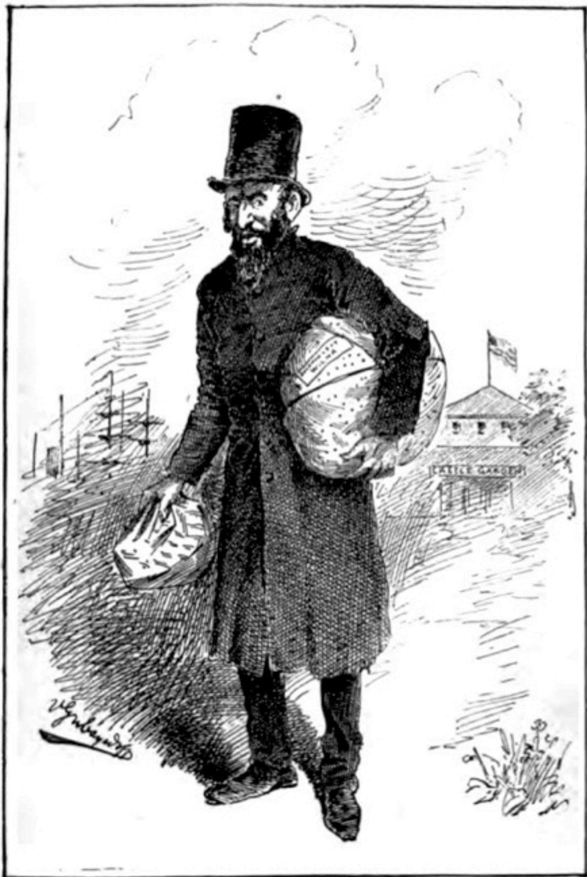
THE JEW IMMIGRANT.