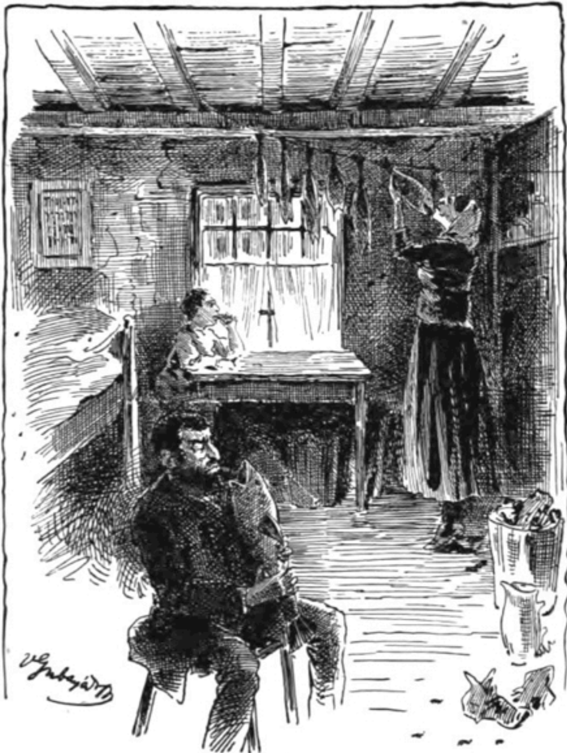
STORING THE STALE FISH OVER NIGHT.