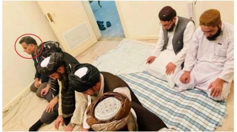
TALIBAN PRAYING WITH ISI CHIEF

the mass murders committed by the Russian, Iran regime and its proxies on the Ahlul Sunnah of Iraq and Sham is also considered as something outside their jurisdiction. Despite of the fact that enemies of Islam slaughtering the Muslims, they seek to have political and international recognition for their own thirty needs.