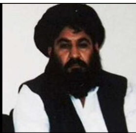
Mulla Akhthar Mansoor