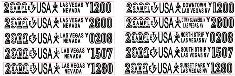
Figure 2 Standard vs. Custom Stamp Text

Stamp customization is especially useful for cities with multiple events, as shown in the example.