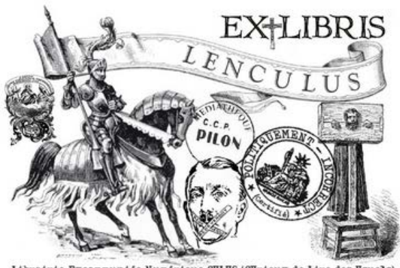
Librairie Excommuniée Numérique CULUS (CUrieux de Lire des Usuels)