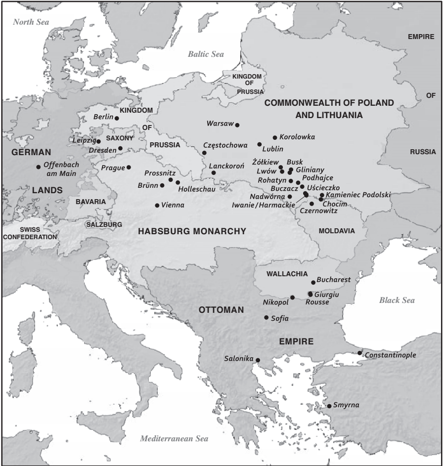
East and Central Europe ca. 1770