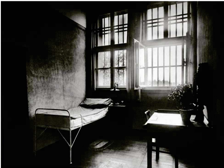
Hitler's prison cell in Landsberg Fortress where he wrote the present work, 'Mein Kampf' (My Struggle): Volume 1: A Reckoning.