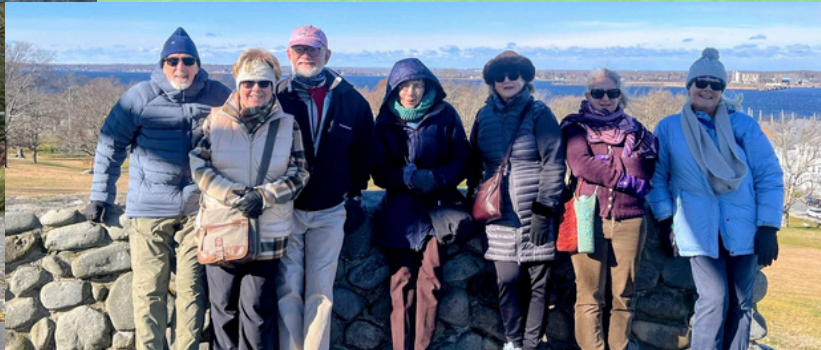
Facebook Post by AVA Walk 'n Mass Volkssport Club - Thanks to all those who joined us in Fall River.