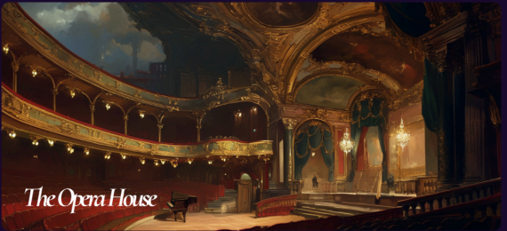
The Opera House