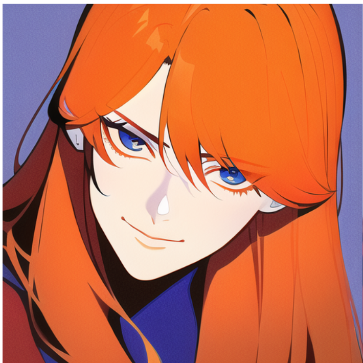
Clip skip: 1