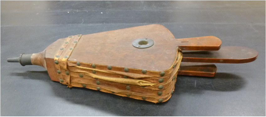
Figure 4. Soffietto per annegati , eighteenth century. Archivio di Stato di Venezia.

made at the Carmelite monastery of the Scalzi in the north of the city. As the inclusion of this item indicates, Gloder was responsible for collating the elements of the machine and did not manufacture every element himself. The comprehensiveness of the box's contents mirrored the detailed allocation of responsibilities to people who might be involved in any resuscitation attempt in the legislation. The resuscitation box included everything that was required for a rescue attempt: the ready availability of tobacco and the means to ignite it were not left to chance.