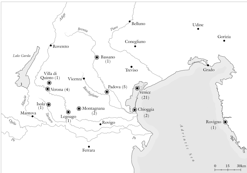
Figure 3. Rewards for resuscitation in Venice and its territories. Drawn by Matilde Grimaldi.

dimension of the strategy was significant. The Health Magistracy sought to counteract the possibility that an observer would fail to act by articulating specific roles and tasks. Parish officials were made explicitly responsible for ensuring that the patient was transported to a suitable location; named groups were expected to fetch a physician or surgeon who in turn was required to carry out the prescribed treatment. As such, the method to avert deaths from drowning was a public health policy because it sought to prevent deaths and to prolong life via “organized efforts of society.” The magistracy used print to communicate with the key participants of a parish-focused public health network to achieve its goal of “recalling submerged persons to life.” 70