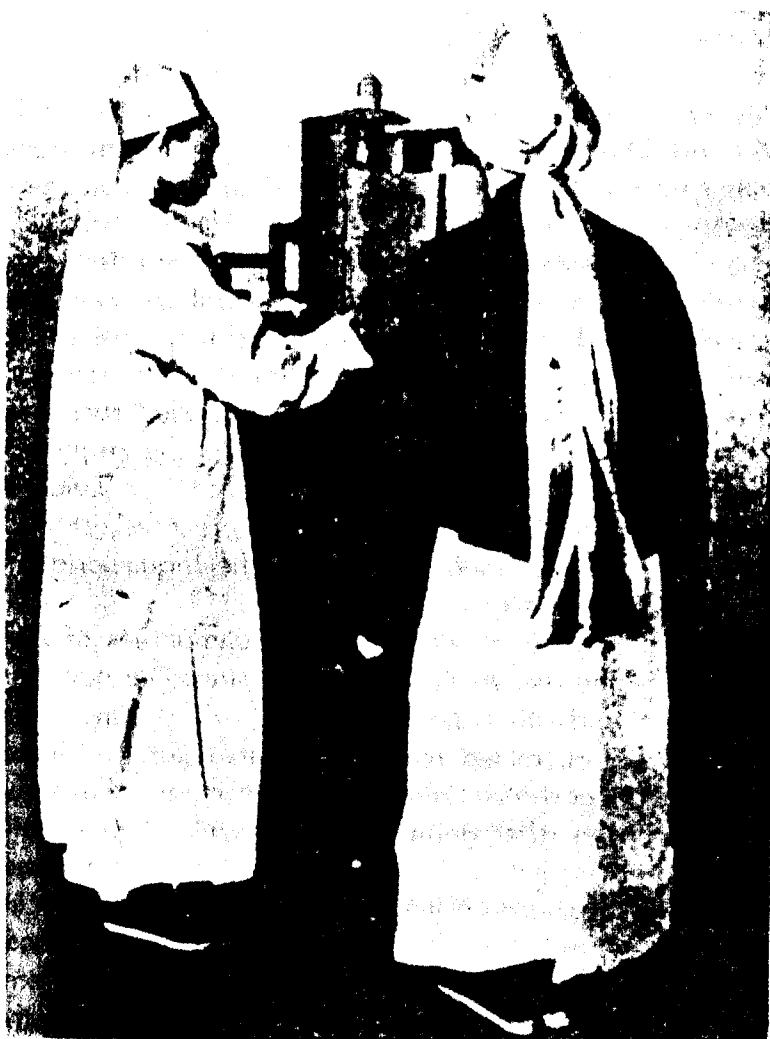
CHINESE JEWS AT THE CEREMONY OF READING THE TORAH