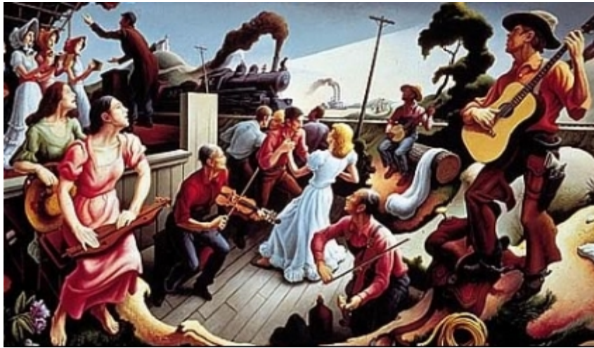
Thomas Hart Benton: From his &quot;The Sources of Country Music&quot; series

The appeal to national sentiment should set us on guard, whatever its source. And when it comes as does Benton's with his conceited anti-intellectualism, his hatred of the foreign, his emphasis on the strong and masculine, his uncritical and unhistorical elevation of the folk, his antagonism to the cities, his ignorant and violent remarks on radicalism, we have good reason to doubt his professed liberalism.